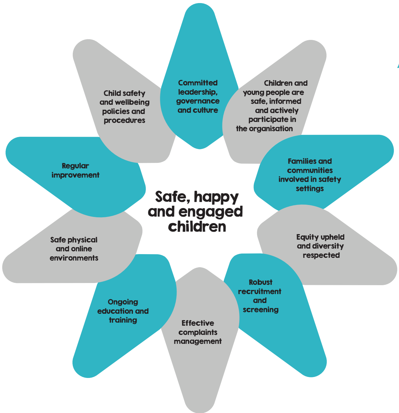
Wheel of Child Safety